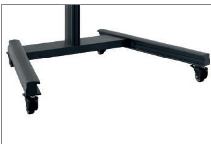
Castors with locking brake