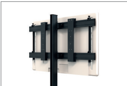
Cable routing along the rails